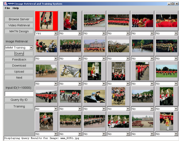
Figure 2. Improved query results by using the trained system

Different people may have different concerns when they look for relevant images. Taking the query image in Figure 2 as an example, some people may want to find the parade scene, some may want to find a horse, and some other people may think the human object looks more appealing to their interest. Hence, it is important that more users should be involved into the training process because fewer users may have bias on the query results. Currently, after 1,500 queries with feedbacks have been issued, 5,157 distinct images have been covered.