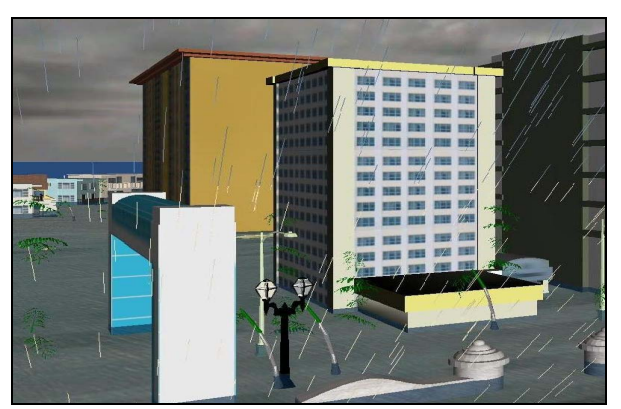
Figure 3. Branch Breaking and Flying Effect for Fort Lauderdale Beach Animation Scenario

3.2.3 Branch Travel along Vertical Plane. The discussion above considered the branch flow across the XY plane. However, wind driven movement of broken tree branches also exhibits motion along the vertical plane. In order to animate branch motion across the vertical plane, we simply randomize the branch motion on the vertical plane with the vertical height ranging from the bottom of the tree trunk (ground level) to one tree height above the trunk top. This along with the points obtained from the XY plane travel velocity calculation blends together extremely well to animate branch flying effects. Figure 2 and Figure 3 show our branch breaking and flying effect animation on a simple terrain and as part of the Fort Lauderdale Beach Animation scenario respectively.