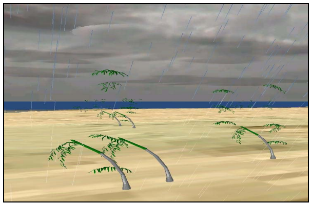
Figure 2. Branch Breaking and Flying Effect Animation

A coherent and near realistic representation of the branch flying effect requires some sort of friction and slow down effect to be introduced to the branch travel velocity calculation. The friction coefficient \mu which represents the air friction effect across the terrain by limiting the travel speed of a broken branch in a certain direction, along with the FrameRate used in Equation 3 ensures that the motion of each branch with respect to the wind speed is rendered appropriately for the 4 fps rate and that the branch itself does not simply vanish. To elaborate further, a wind speed value of 90 mph would thus mean that the branch travel speed along the terrain is 18 points per frame or 72 points per second.