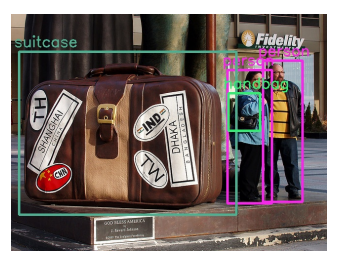
Figure 2. The object detection result of an example image from the COCO dataset [28]

Among these tasks, image classification whose objective is to classify an image into a specific category based on its visual content is regarded as the most basic one. There are a large number of datasets for image classification, such as MNIST [27], CIFAR [25], ImageNet [9], and Food-101 [3]. In this benchmark, ImageNet is used to pre-train the model, while the data in the Food-101 datset will be used to finetune the model. Top-k accuracy is usually chosen as the evaluation metric for most image classification tasks, which can be defined as follows. Given an image, the image classification model produces a probability of the image belonging to each category. The image is regarded as correctly classified if the true label is among the categories with topk highest probabilities. The top-k accuracy can thus be defined as the portion of correctly classified images among all test images, and we use k = 5 for the energy-efficient DNN training benchmark. Since DNNs for image classification are usually a CNN model with limited types of operations and relatively simple network structures, training the image classification models on FPGAs should be the easiest task to achieve.